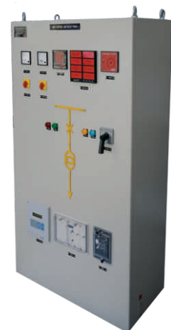
Relay & Control Panel