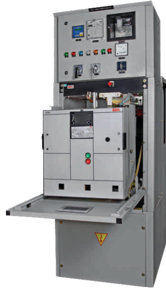
Power + F