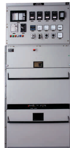
Power + F3