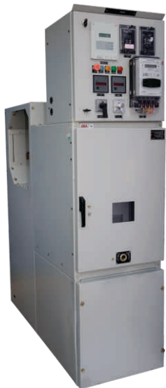
Power + V